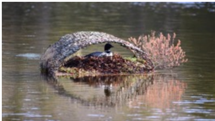
Another early nest was established on Pleasant Lake on May 9. The adults will take turns incubating the eggs for approximately 28 days.

At this time of year, loons will often get on & off of their nest site before the eggs are laid so it can be tricky to determine if they are in fact nesting. They need to make sure everything is just right before settling in! A good way to know for sure is if they are sitting consistently on the nest for several days. Another good sign that they may be nesting is if you are suddenly only seeing one loon swimming around the lake or territory by itself.