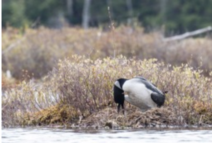
This loon stands to turn the egg(s) in its nest on Bolster Pond. This is one of the first nesting reports of the 2016 season.

With a record early ice-out this year on many lakes in New Hampshire, people started asking if the loons were going to nest earlier than usual. I didn't think it was going to happen, but it looks like I may be wrong! So far we have gotten reports of 3 loon pairs on nests: one in the Monadnock region, one in the Sunapee region, and one in the Lakes Region. Two have been confirmed with photos (see below) and both nests were first observed exactly a week earlier than last year.